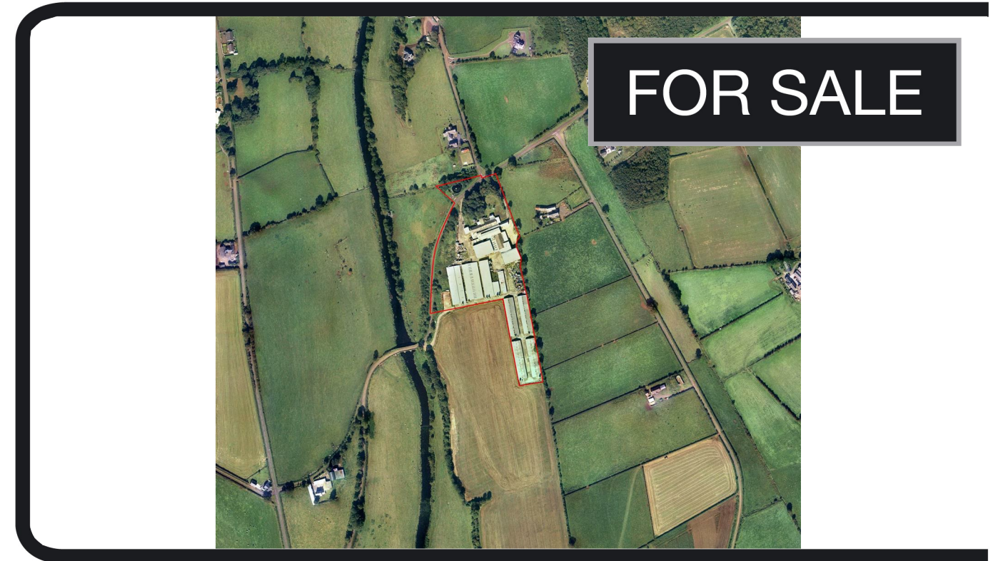
14-16 Seneril Road, Bushmills, BT57 8TS