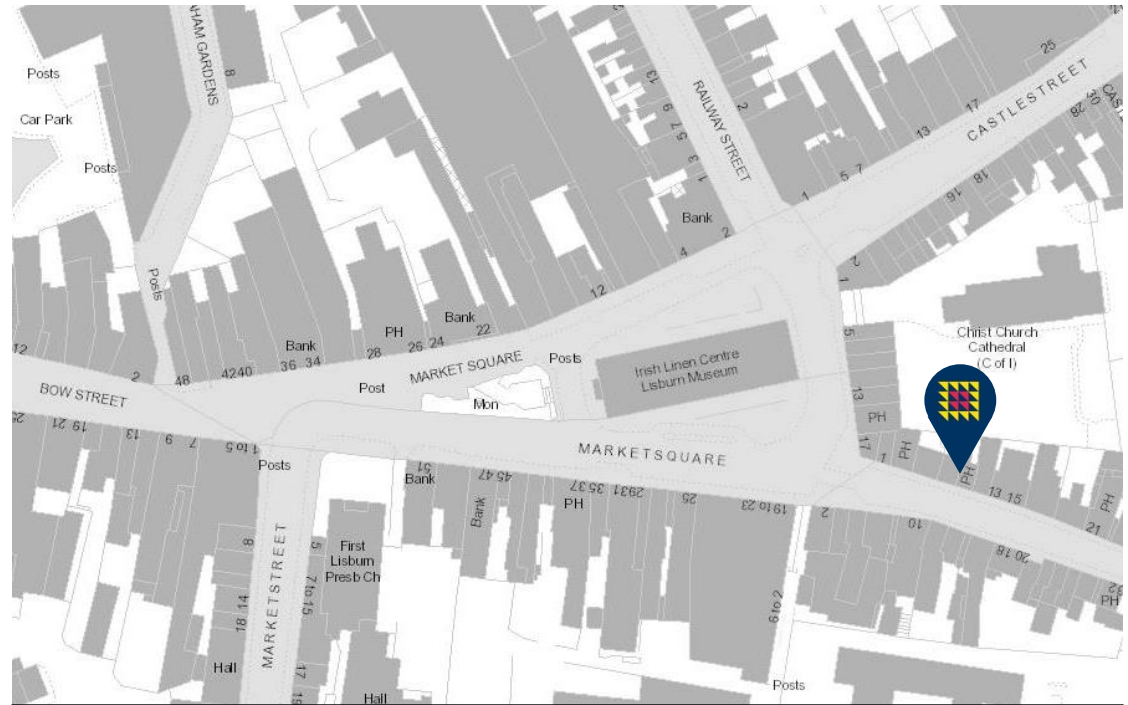
The Linfield Bar, 9-11 Bridge Street, Lisburn