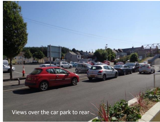
Views over the car park to rear